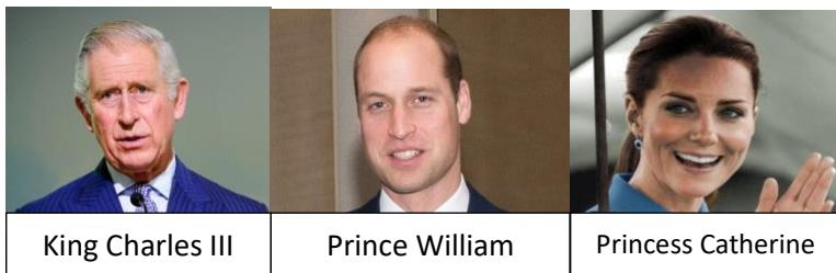
King Charles III