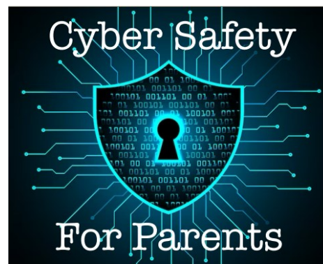
Cyber Safety Parents Edition.

Please come and join us on Monday 2nd June at 2pm for a parent information session around Cyber Safety. This is being run by Gloucestershire Police and should be a really informative session. We're really hoping to see lots of parents so please put the date in your diary!