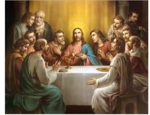
Jesus had a last supper with his disciples. This day is called Maundy Thursday.

Easter is celebrated around the world with Hot Cross Buns, Easter Eggs and Simnel Cake. Christians hold special church services and also take communion (bread and wine) – Jesus said 'Do this in remembrance of me.'