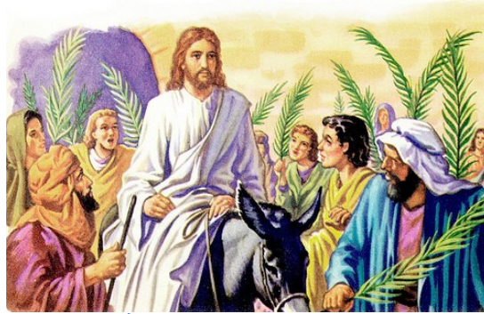
Jesus rode into Jerusalem to celebrate the Jewish festival of Passover. This day is known as Palm Sunday because people waved palm branches to welcome him.