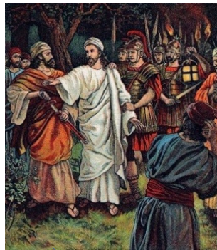
Jesus was arrested in the garden of Gethsemane.

Easter is celebrated around the world with Hot Cross Buns, Easter Eggs and Simnel Cake. Christians hold special church services and also take communion (bread and wine) – Jesus said 'Do this in remembrance of me.'