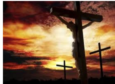
Jesus died on a cross. This day is called Good Friday.